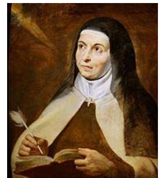
St. Teresa of Avila

Let nothing disturb thee; Let nothing dismay thee: All thing pass; God never changes. Patience attains All that it strives for. He who has God Finds he lacks nothing: God alone suffices."